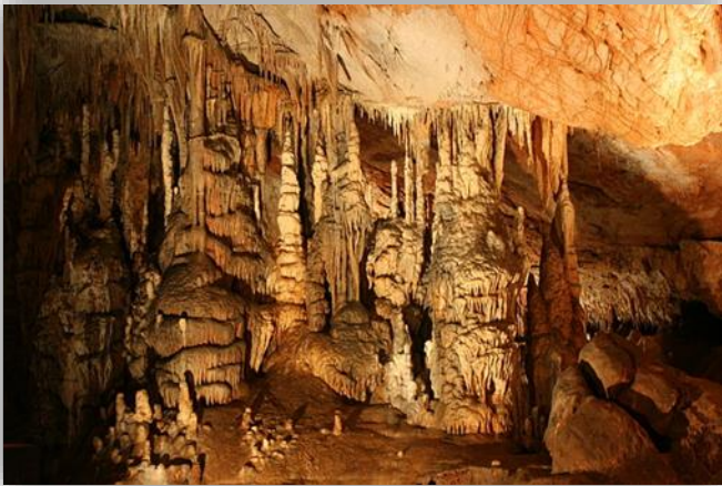
Caves of Aggtelek Karst and Slovak Karst