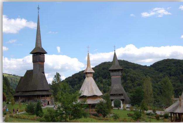
Wooden Churches of Maramureș